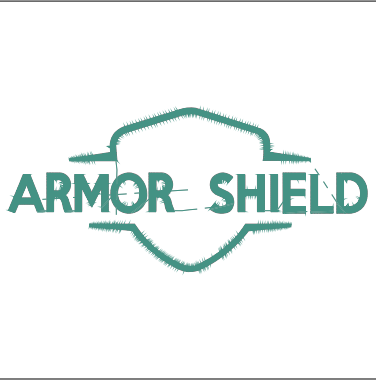
#: 1 Color: Light Green Code: 26 Brand: Wilcom Stitches: 3478 Thread Used: 51.93ft